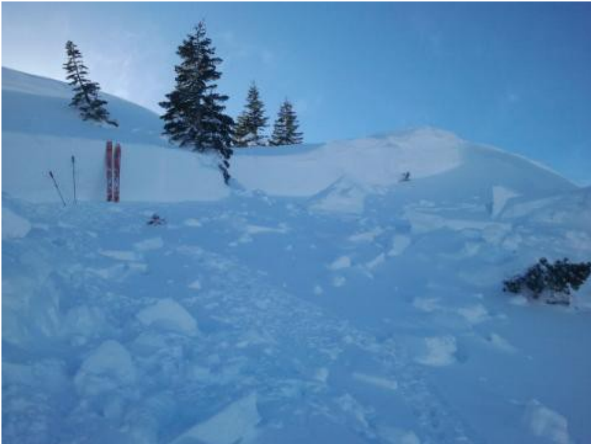
Dec 23, 2013 natural avalanche occurring in Drifter Bowl, failing on Dec 12 near crust facet layer.

Advisories were available 24 hours a day, 7 seven days per week on the internet and by phone. The website experienced over 501,067 page loads this winter. During the forecasting season from November 16th to April 14th, the website was viewed an average of 3,115 times per day with a record single day maximum of 14,247 page loads occurring on December 26th. The recorded phone message was accessed over 3,000 times. Website traffic increased in page views by 2.5% and unique visitors by 17% over the previous busiest year. An online archive of advisories can be found at: http://www.sierraavalanchecenter.org/archive .