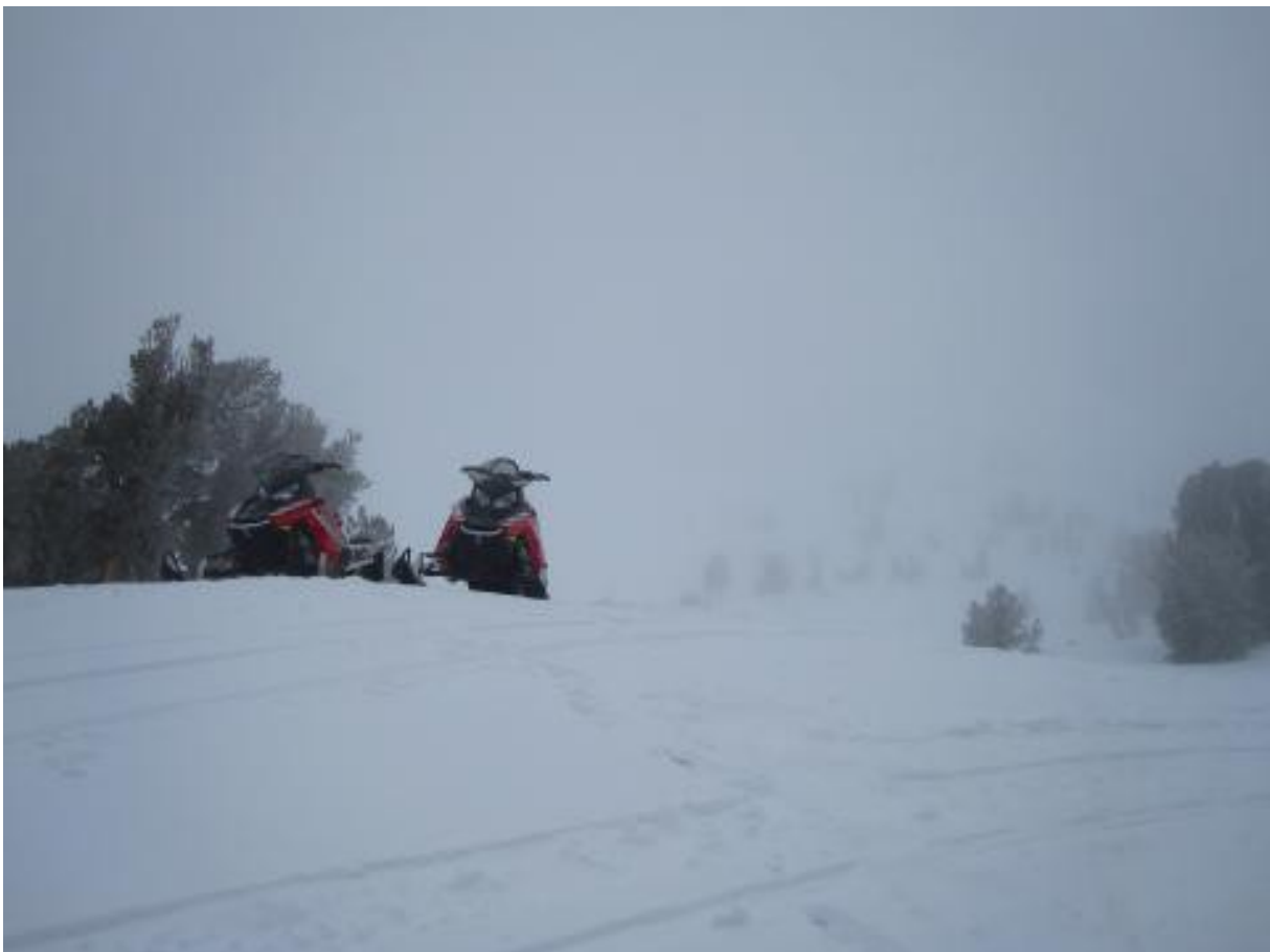
New snowmobiles at work on Relay Peak, NV.

The Board of Directors obtained sponsorship of the avalanche center by Polaris Industries. Two brand new 2013 Polaris 600 RMK 155 snowmobiles were donated to the avalanche center. With these snowmobiles, the forecasters were able to make observations in high snowmobile use portions of the forecast area that are difficult to access on skis alone in a single day.