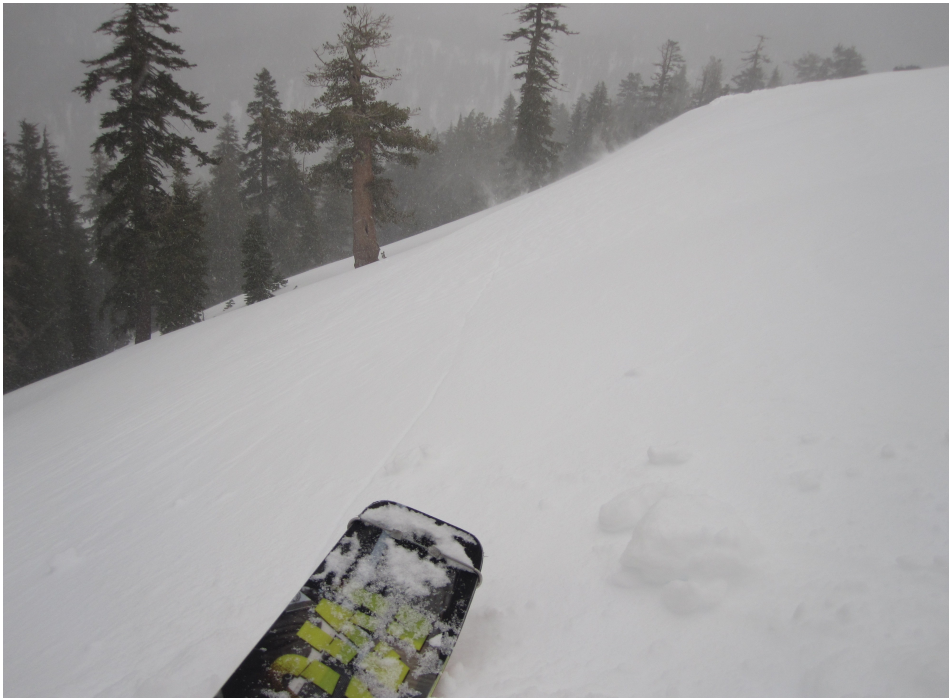
Long shooting crack on Silver Peak, CA.

The Board of Directors is the financial backbone of the Sierra Avalanche Center. Through soliciting donations from the public and organizing/marketing fund raising events, they are the major source of funding for the Sierra Avalanche Center. Money raised by the Board of Directors covered approximately 50% of the operational costs for the Avalanche Center in 2012-2013. In past seasons, Board of Directors contributions have accounted for up to 95% of the avalanche center's annual operating costs when less USDAFS money was contributed. Through a collection agreement with the Tahoe National Forest, these funds pay for forecaster salaries and the costs of professional level continuing education. Additionally, the Board of Directors provides compensation for contracted professional observers and some equipment needs for the forecasters.